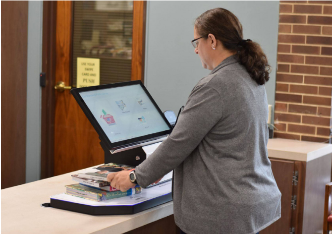
To better serve library customers, East Brunswick Public Library updated its check out stations.