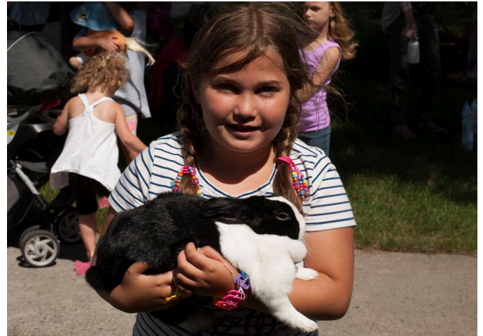
East Brunswick Public Library is highly regarded in the community for providing high-quality programming and events for families.

Housing: New housing construction is bringing in new families. Multi-generational families are living together and have diverse interests and needs. Greater housing density and increased commuting has resulted in increased traffic. East Brunswick is losing its “country charm.” The generation replacing aging population not interested in the suburban lifestyle East Brunswick offers nor can they afford to