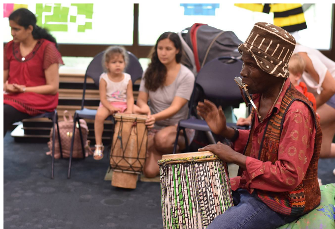
East Brunswick Public Library regularly offers special events and programming that reflect the diverse community it serves.

Political leaders Need to meet with local policymakers and politicians to discuss and make suggestions to deal with change. Secure funding for enhancing programs. Venue for workshops and meetings with citizens to explore solutions to community challenges or issues.