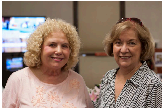
The Friends of the East Brunswick Public Library actively work to fundraise and serve as advocates on the library's behalf.

Delay of financial stability: Young people burdened with mounting student debt are staying with parents longer and starting families later. It is increasingly difficult, particularly in the Gig Economy where careers were first reduced to jobs and then tasks, to have the financial stability necessary to buy a home and raise a family.