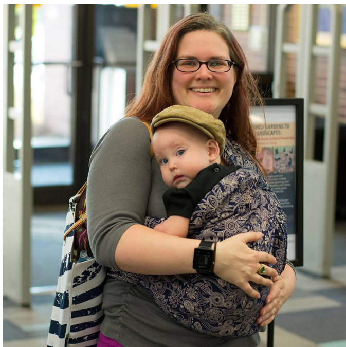
East Brunswick Public Library serves a community of all ages.

Friends of the Library Place for a book sale, a place to meet, recognition.