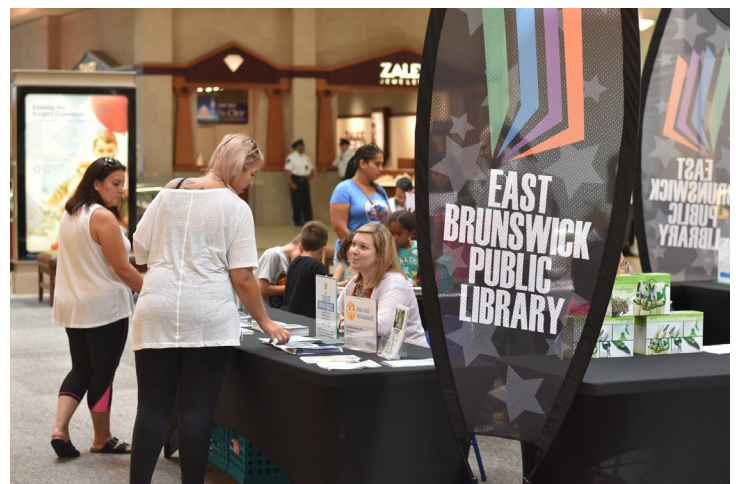
East Brunswick Public Library regularly participates in community outreach events to register new library card holders, better connect to the community and share information about library programs and services.